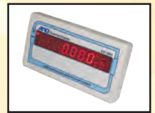
External Display ED-1003 (Optional)

* Smart range function: The minimum weighing value will switch to 0.005ct/1mg automatically when the display value exceeds 310ct/62g but returns to 0.001ct/0.1mg by pressing the RE-ZERO (tare) key.