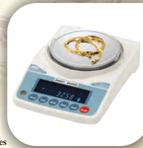
FZ-GD/i FX-GD/i Series