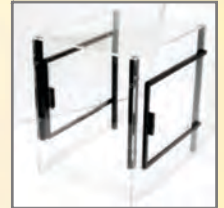
Outer Windshield (WS-1005) For better performance As Standard for FZ/FX-CT As Optional for HR-AZ/A